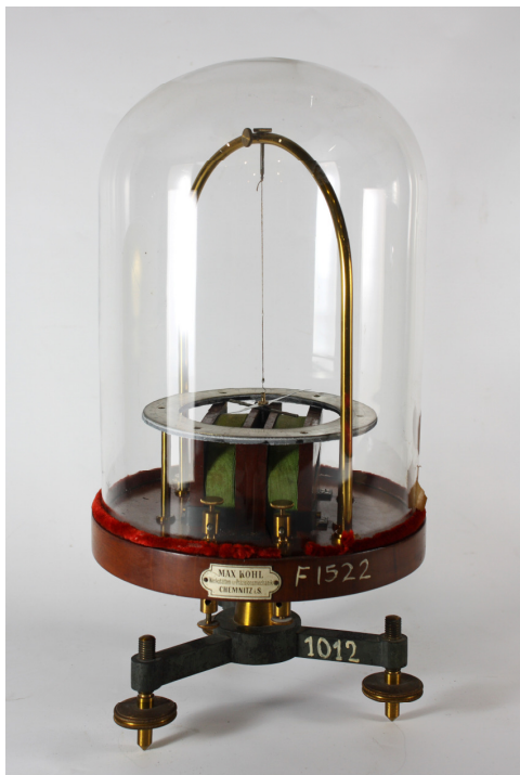
Figure 1 - Galvanometer ( Museu de Física collection).

Figures 1, 2, 3 and 4 present images of didactic instruments made by Max Kohl (circa 1906) which belong to the Museo de Física collection (UNLP).