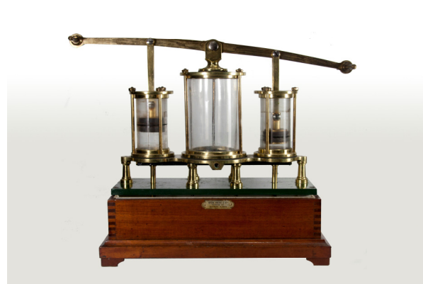
Figure 4 - Vacuum pump ( Museu de Física collection).