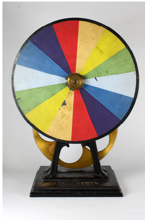
Figure 2 - Newton disc ( Museu de Física collection).